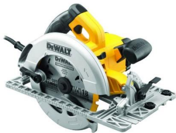
Buzz saw / handsaw